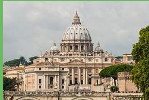
Roman Catholic church